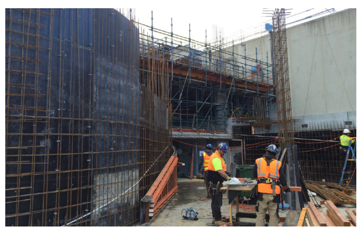
Forming of Car Park Ramp Walls