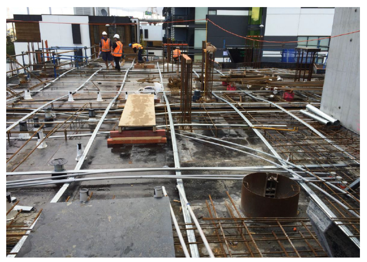
Level 2 Pour Preparation

making good progress. On the whole, construction continues at a good pace with works proceeding well on site.