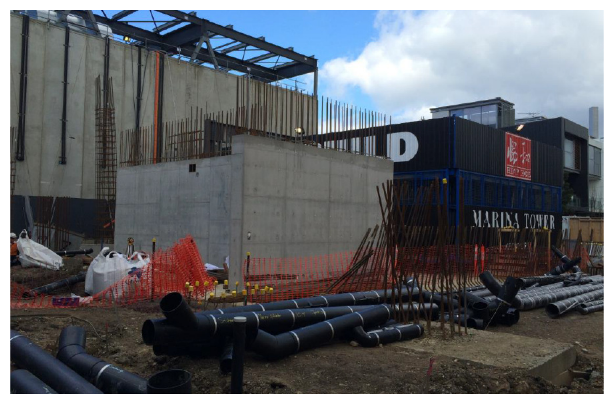
Apartment Ground Floor Sheer Walls